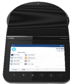
MiVOICE CONFERENCE PHONE