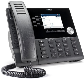
MiVOICE 6920 IP PHONE