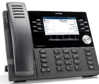
MiVOICE 6930 IP PHONE