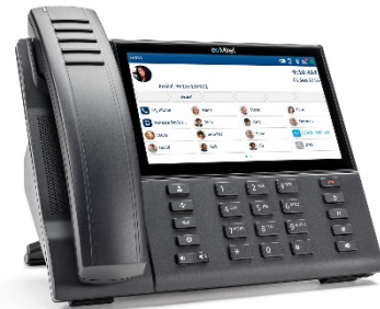
MiVOICE 6940 IP PHONE